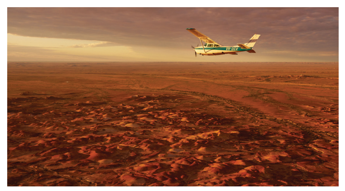
Rawnsley Park Station, Flinders Ranges & Outback South Australian Tourism Commission