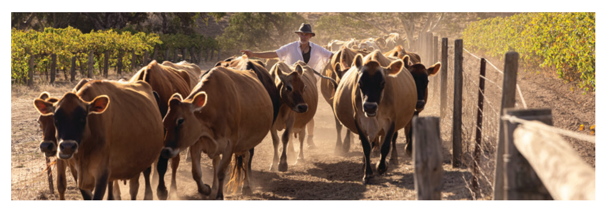
Williamstown, Barossa